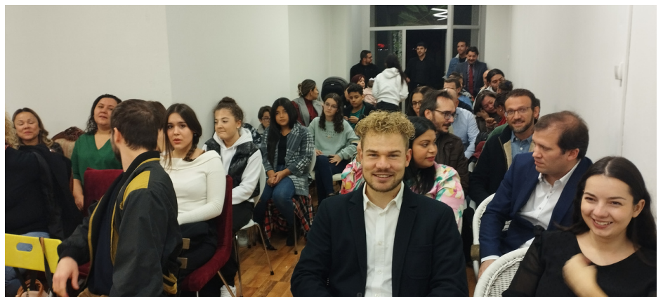
Lérida group November 2022