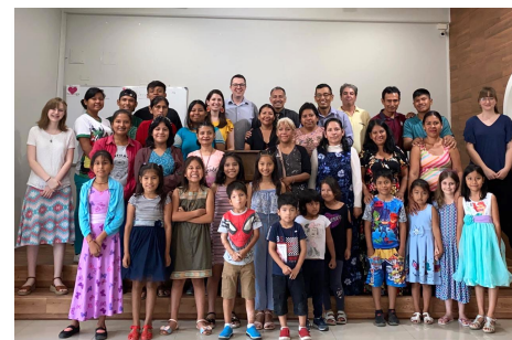
36 PEOPLE IN ATTENDANCE AFTER 36 DAYS OF STRIKES AND CITYWIDE SHUTDOWN!