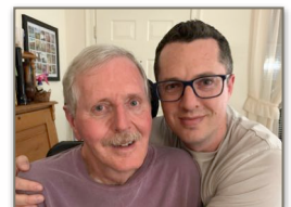
MY DAD AND ME