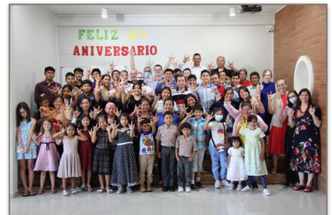
4TH ANNIVERSARY OF IGLESIA BAPTISTA SORDOS PARA CRISTO