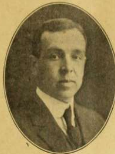
Professor J. Gresham Machen, D. D.

"After that, he was seen of above five hundred brethren at once: of